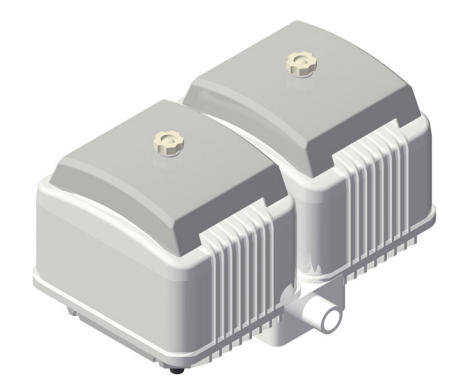
Figure 2: AU-400