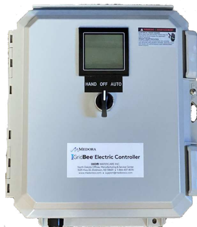
Figure 1: GridBee Full Featured SCADA Box