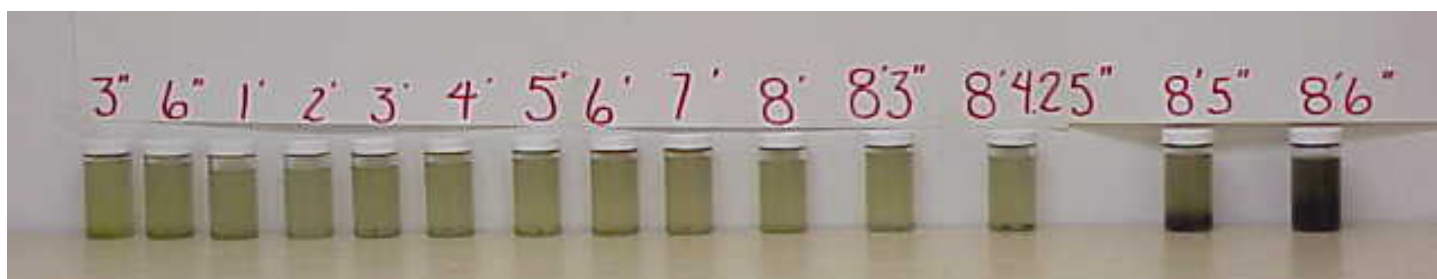
Figure 1: Water Samples at Various Levels in a Primary Wastewater Lagoon.