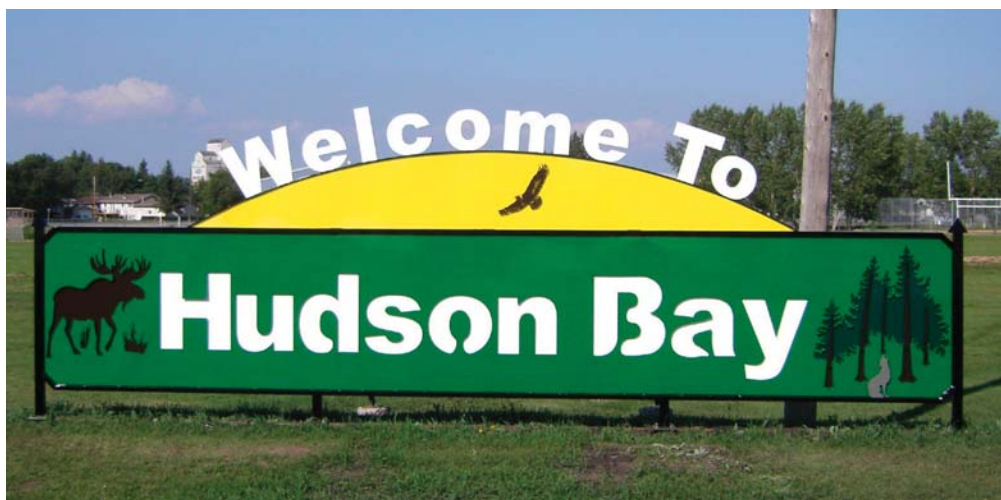
Figure 1: Hudson Bay, Saskatchewan chose the MIEX® System for DBP Reduction