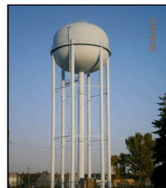
Aerial view of the Reservoir under three tennis courts; the Reservoir access hatch; the elevated South Tower.

Customer: Information is available upon request from Medora Corporation. 866-437-8076 info@medoraco.com