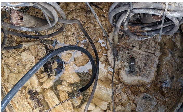
Before the GridBee® AP500 Wet Well Mixer

The AP500 works. Our first AP500 installation was in a lift station that supports a subdivision here in Berryville. As you can see in the before photo, the grease build-up in the lift station well was bad. I put the AP500 in the well as is to see how well it would work. I put a timer on the AP500 and ran it for approximately four hours at night, split up into two 2-hour intervals. I am planning on adjusting the timer to run the AP500 for just two hours per night. Thank you to everyone on the Ixom Watercare team. The AP500 is a great product!